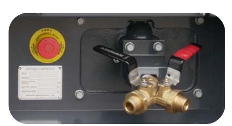
Dual air outlets

Easy to operate control panel with LED fuel guage, digital display and clear operating instructions